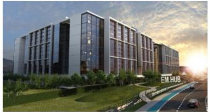
ActivePure is installed throughout Em Hub Kota Damansara