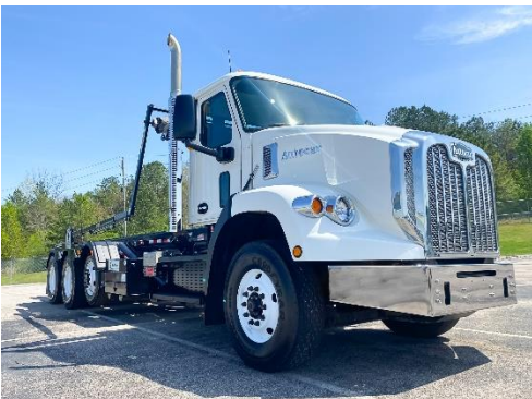
Autocar DC-64R Refuse Truck

The DC-64R conventional truck for severe-duty refuse applications is assembled in Birmingham, Ala. As all DC-64R trucks do, the Mickey Flood Tribute Truck comes standard with a Cummins engine. The workspace of the cab fits three and is spacious and functional with ample foot, leg, hip, elbow and shoulder room and a fully adjustable seat and steering column. But what truly sets it apart in the industrial truck market is the vehicle’s BADASS strength, durability and safety attributes. The DC-64R is the first truck ever built to feature ultra-high-strength 160,000 PSI steel frame rails, 24% stronger and lighter than other trucks in the market.