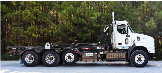
Mickey Flood Tribute Truck

EREF's Annual Charitable Auction is open from June 16 to 30. To participate, text "EREF Auction21" to 76278, click the blue link to register and enter bids on available items.