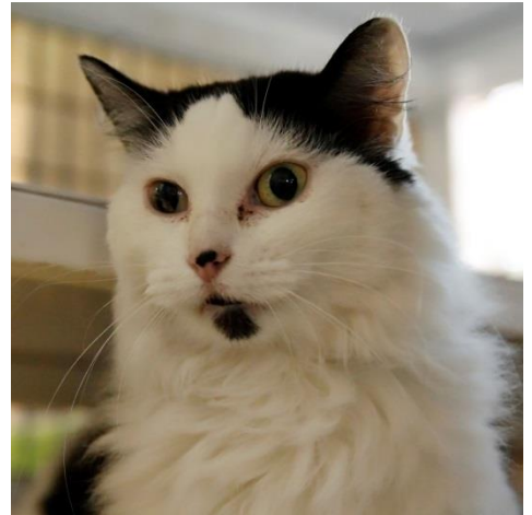
Lily and Dudley are both available for adoption at Operation Kindness.