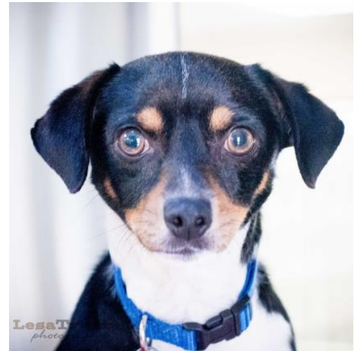
Milton is a 1-year-old dachshund mix available for adoption

Founded in 1976, Operation Kindness is the original and largest no-kill shelter in North Texas. Its mission is to care for homeless cats and dogs in a no-kill environment until each is adopted into responsible homes and to advocate humane values and behavior. Operation Kindness has saved nearly 80,000 animals since its inception. Operation Kindness cares for an average of 300 animals daily, with another 100-150 animals in foster homes. Operation Kindness assists nearly 4,500 dogs and cats each year. Learn more about Operation Kindness at http://www.OperationKindness.org or on Facebook ( www.facebook.com/pages/Operation-Kindness/30251945822 ).